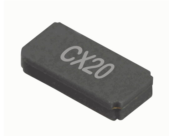
Outline (mm) -C-SM4 = Solder plated (Pb free)